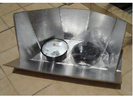
'CooKit' containing a pot with a clear glass lid next to a pot with a metal lid and enclosed in an oven bag