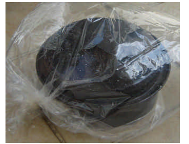
Pot with a metal lid and enclosed in an oven bag