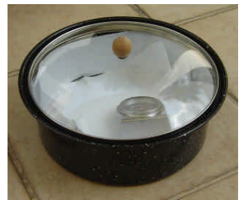
Pot with a clear glass lid