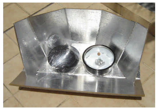
'CooKit' containing a pot with a metal lid and enclosed in an oven bag next to a 'HotPot'