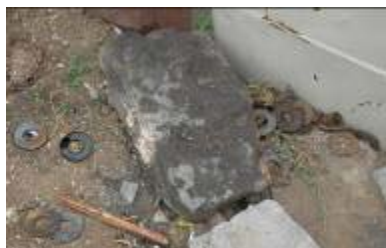
Remains of burned oil filters

CARITAS , an NGO based in Rome, provided field trips to villages and elderly homes revealing the urgency of rural families and elderly people needing a supplement to fuelwood and a stove which burns dung efficiently. As noted, in the Northwestern reaches of Armenia where wood, electricity, and gas are not available, dung is the principle form of energy. Calling on homes for the elderly small storages of plastic, cloth, cardboard, and discarded oil filters are to be burned for heat come winter- a few single elderly people do not have heat for their room in winter.