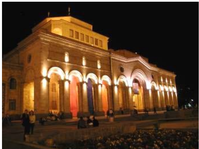
Historic building in Yerevan, Armenia