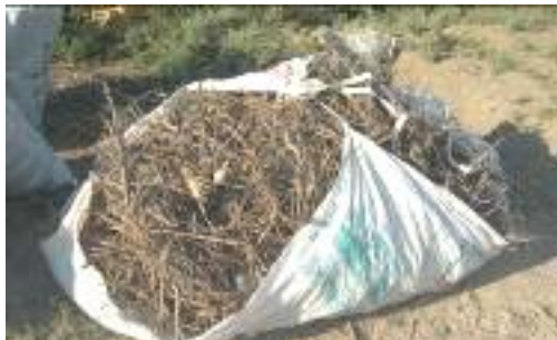
Cotton stalks bundled

SOLAR COOKING IN TURKEY WAS BORN eight years ago. The Rotary Club of Adana-Seyhan in Turkey pursued the idea of using solar cooking when solar cookers made the cover story in the Rotarian magazine November 1997. Adana has a 25 year history of using solar water