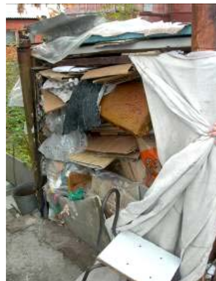
Cardboard, plastic, and oil filters used as fuel.