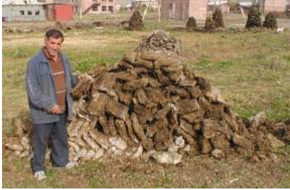
Stack of manure for heating and cooking.