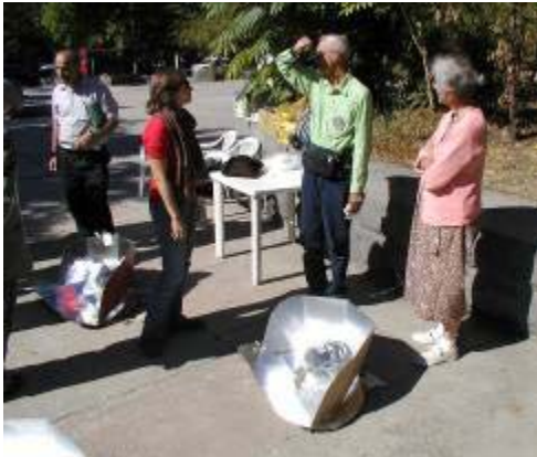
Notice long shadows