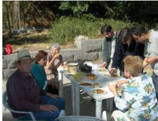
Lunch at 3PM in Yerevan.