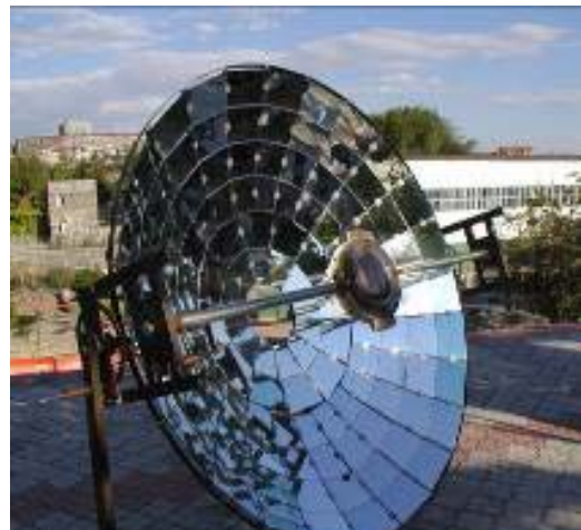
Parabolic solar cooker