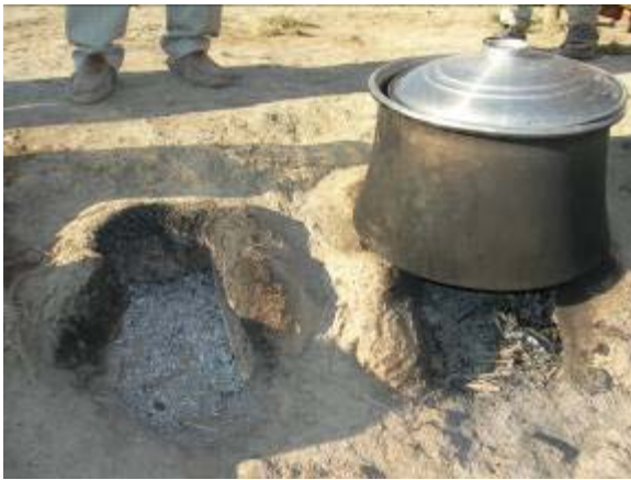
Local mud stove